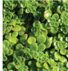
Sedum Green Mound