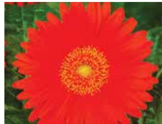
Garvinea 'Sweet Glow'