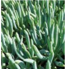
Senecio Blue Chalk Sticks