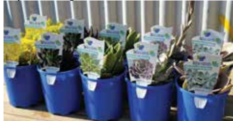
New Succulents with new labels

Succulents are so hot right now! In response to market demand we are expanding our current range with more than 65 new varieties of succulents now in propagation. Our range embraces Haworthia , Gasteria , Aloe , Crassula , Kalanchoe and includes classic favourites such as Echeveria 'Mexican Giant', Senecio 'Blue Chalk' and Sedum 'Gold Mound'. We are very excited about expanding this wing of production and anticipate that it will be well received by new succulent enthusiasts and dedicated collectors alike.