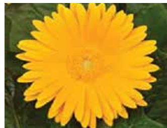
Garvinea 'Sweet Honey Pot'