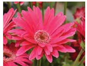
Garvinea 'Sweet Sixteen'

Garvinea Gerberas have been bred for superior growth, vigorous flowering and pest and disease resistance. They are much easier to grow than other Gerberas .