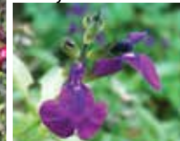
'Navajo Dark Purple'