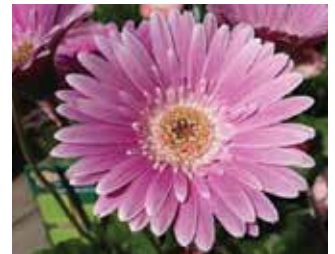
Garvinea 'Sweet Heart'