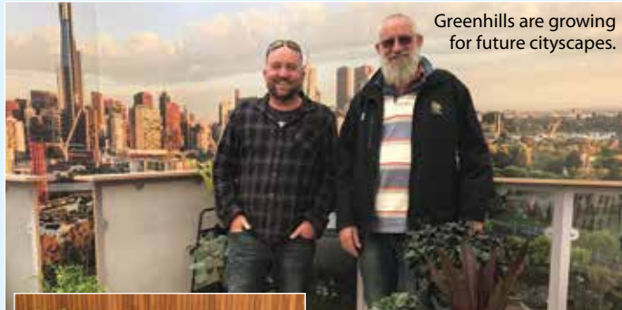
Greenhills are growing for future cityscapes.

Colourwise made its annual pilgrimage to Melbourne looking for new and interesting lines for you, our customers. Colour was still a dominant theme with robust and hardy colour lines being well sort after. With increased apartment living in most major capital cities apartment and balcony planting was also a common theme. Succulent bowls and vases, balcony citrus, herb planters and hardy colour featured strongly in many displays. Lines we secured from the trials will become available to customers over the next six months.