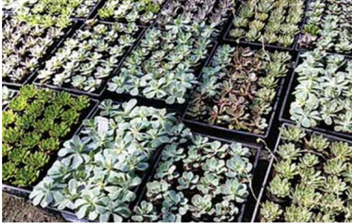
New Succulent Mix